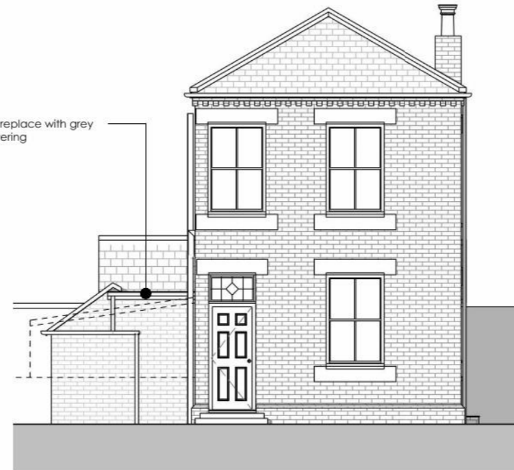
East Elevation 1 : 100