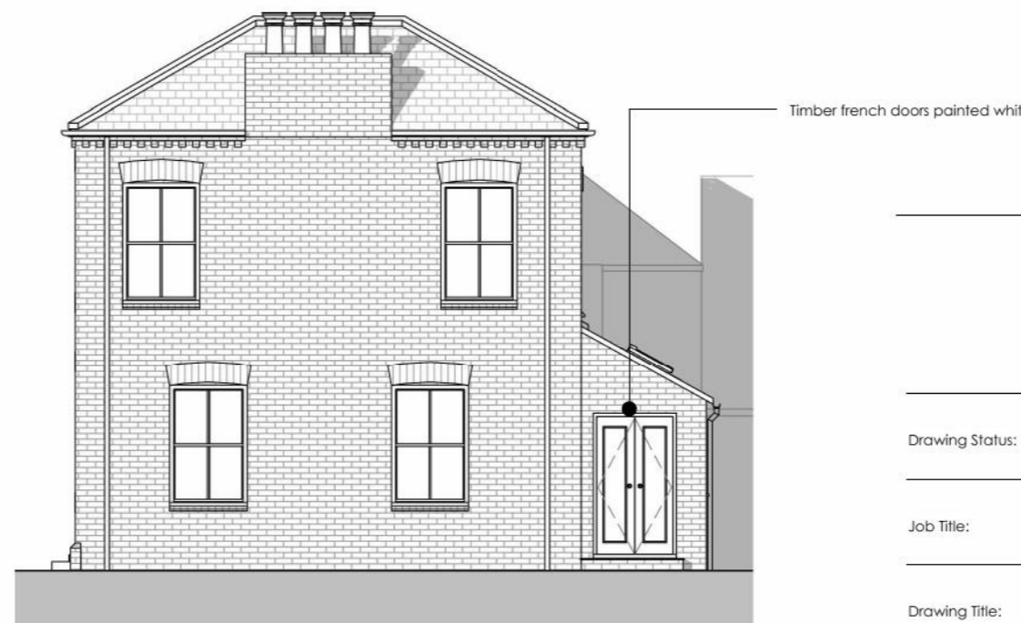
North Elevation 1 : 100